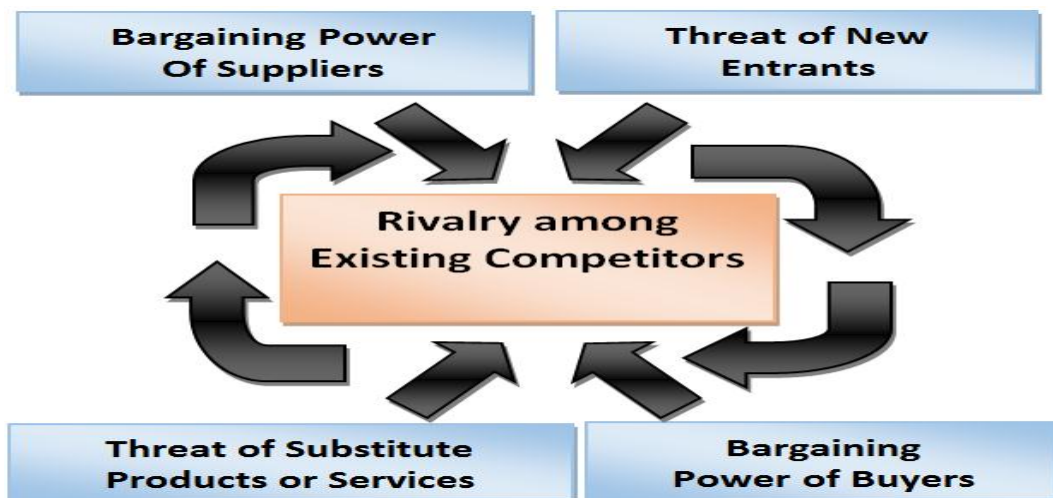
Figure-1. Model of Michael Porter's

Factor is the intensity of competition and if is known the intensity of competition, profitability is also determined. In this context,