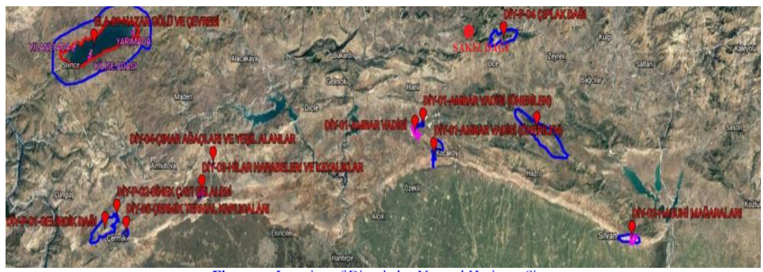
Figure-1. Location of Diyarbakır Natural Heritage Sites

The limitations of the research are the determination of Natural Heritage Sites' landscape values along with these sites' borders and the categories of natural sites defined in regulations. Ambar Valley, Hassuni Caves, Hilar Ruins and Rocks, Ergani Plane Trees and Green Areas, Çermik Thermal Spa and Surrounding, Gelincik Mountain, Sinek Brook Waterfall, Çıplak Mountain and Sakız Mountain are limited as the existing and suggested heritage sites which are unfortunately exposed to anthropological pressure in Diyarbakır (Figure 1).