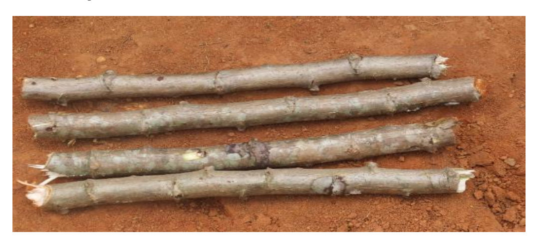
Figure 2: Cassava cuttings (Improved African Cassava)

The experimental trial focuses on cassava, a tuberous root plant. The cassava variety ( Manihot esculenta Crantz ) used for this study is Improved African Cassava (commonly called yacé) (Figure 2). It is a resistant variety, commonly grown and consumed by the Ivorian population in different forms (cassava paste, flour, starch, bread, cake, etc.).