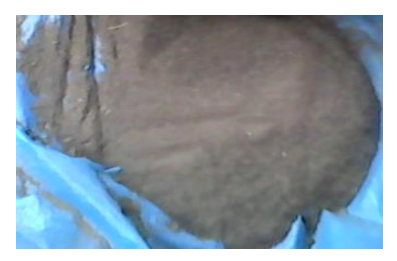
Figure 5: Powder of cocoa bean teguments

The cocoa bean teguments, obtained in a dump in Abobo (Abidjan), were dried, crushed and sieved ( \emptyset <2 mm) before being spread (Figure 5).