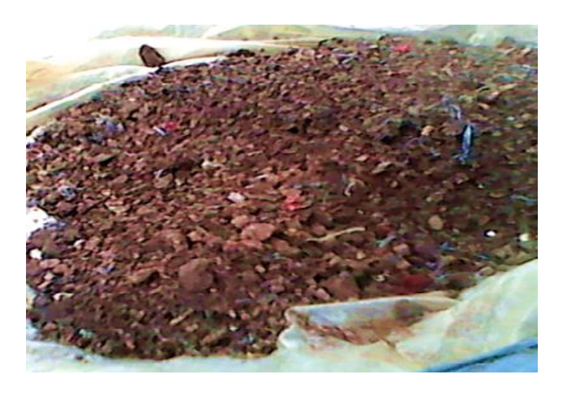
Figure 3: Cocoa bean teguments