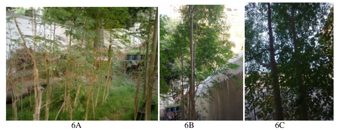
Figure 6A, 6B & 6C: Moringa oleifera planted in Seed Bed, and Trees of 3 years old (9 m high) in Research Garden of Faculty of Agriculture, Cairo University