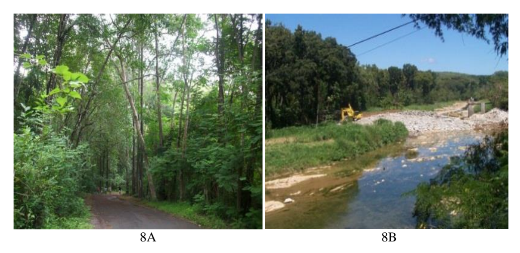
Figures 8A and 8B: Present ecology in Wanagama woods of Gunungkidul

Suharno (2008) found that the involvement of multi-stakeholder in the social forestry development comprises national level, provincial government of Yogjakarta Special Territory, regional government of Gunungkidul, Non-Governmental Organization, community, and academic. The changes of social capital due to the involvement of multi stakeholder are mutual trust, network, and social norms. The implements of welfare and forest preservation by the involvement of multi stakeholder are indicated by apparent from the improvement of welfare of the members of the social forestry farmers and cover area of the social forestry area.