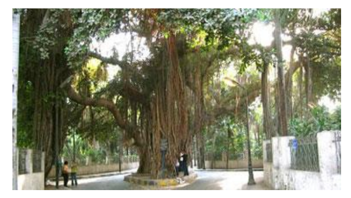
Figure 2: Woody plants species grow well in Cairo

Woody plants growing well (as shown in Figure 2), is showing that land in this country is arable. Geographic and climatic data show Egyptian land is mostly desert and with its very low rainfall. This natural condition may sometimes be associated with poor and backward country, but not for Egypt. So, why is Egypt prosperous and belonged to developing or developed country? Seeing the demographic and natural sources, the answer is because Egypt is passed and controls the Nile water with its continuous considerable debit supplying irrigation water for agricultural practices.