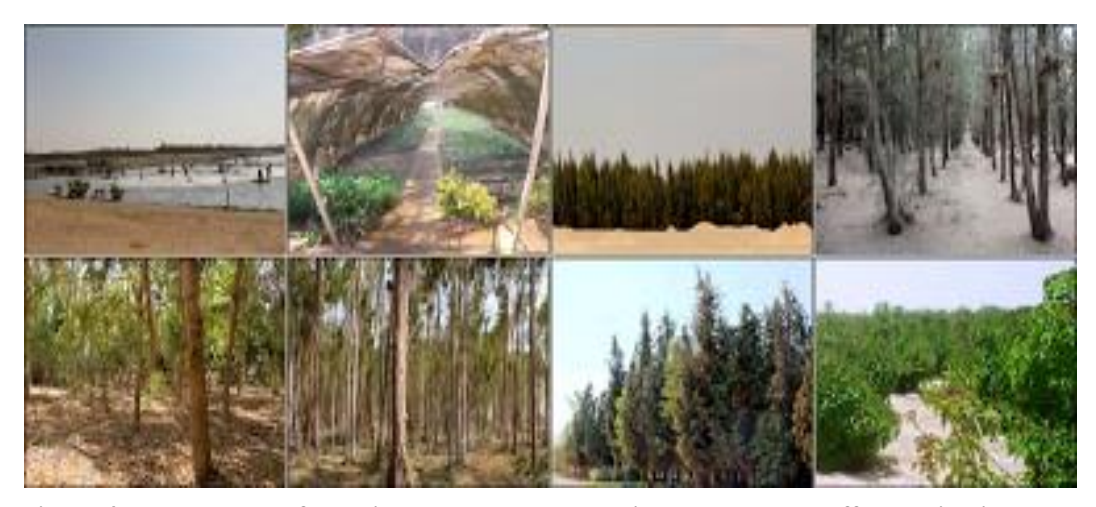
Figure 4: Upper photos from right: sewage water basin; tree nursery; afforestation in desert land; and casuarina plantation. Lower: khay a trees; eucalyptus; Cupressus; Jatropa plantation

El-Ghani et al. (2011) described around Egyptian desert is still found some climbers. In some genera, all of the species are climbers (e.g. Serjania). High abundance of climbers is an important physiognomic feature differentiating tropical from temperate forests. Figure 4 shows some woody plants of afforestation in Egypt.