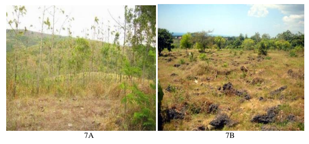
Figures 7A and 7B: Critical and neglacted areas in gunungkidul. jogjakarta, central java, Indonesia