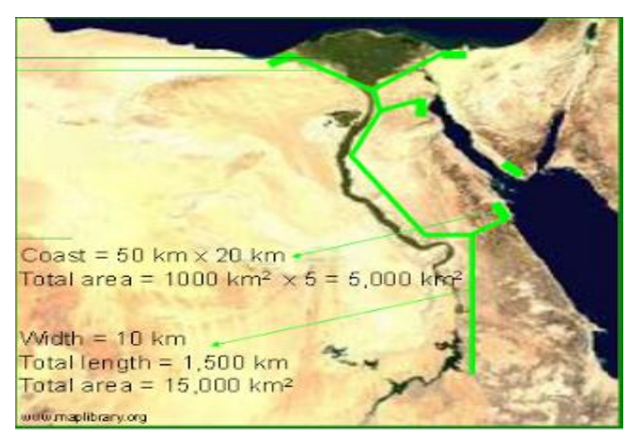
Figure 5: Map of afforestation in Egypt Hany et al. (2014)