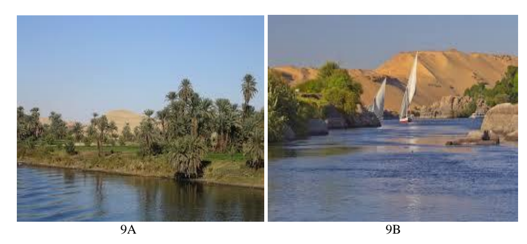
Figures 9A and 9B: The Nile water available is waiting for man-involvement to re-green its banks

The Figures 9A and 9 B below show water and possible plant to be grown. There is a big hope, a dense forest will establish in this area with the available water of the Nile. For comparison, water is always available in the bank of the Nile for the year long, but rainfall is only available in rainy season in Gunungkidul of Indonesia. So, we are optimistic woods and forest will develop in this area of the Nile banks. And we believe that in this area, a long time ago, were ever-green woods and dense forest. It is stand to reason academician of Egyptian said "Egyptian land was greener than Indonesian land".