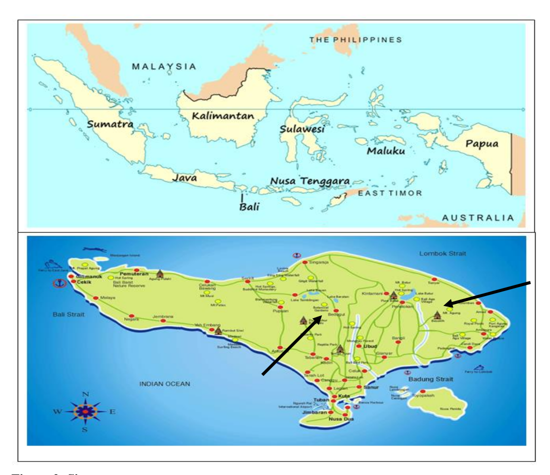
Figure 2: Site map

Primary and secondary data were collected in the study by using various techniques, such as survey, interview, direct observation and documentation. In order to have deep information, the technique of Focus Group Discussion (FGD) was also employed by inviting the key informants of farmers groups, market actors (local traders, exporters, officers of local governments, officers of local banks, and staff of research institution). In this study, data were analyzed by using descriptive method.