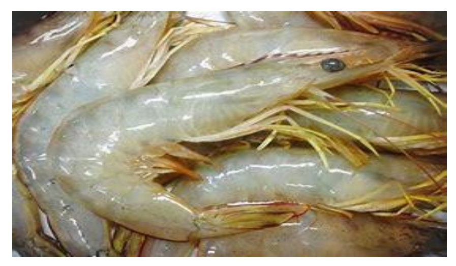
Figure 1: Shrimp (Penaeus monodon)

Shrimp ( penaus notialis ) belongs to the family Penaeidae. It is a species of small aquatic animal belonging to the sub-phylum of crustaceans including lobster and crayfish (Amos and Amos, 1997; Lawal-Are and Akinjogunla, 2012). It is a proteinase sea food that is popular in the diets of most consumers all over the world including Nigeria with no cultural restrictions.