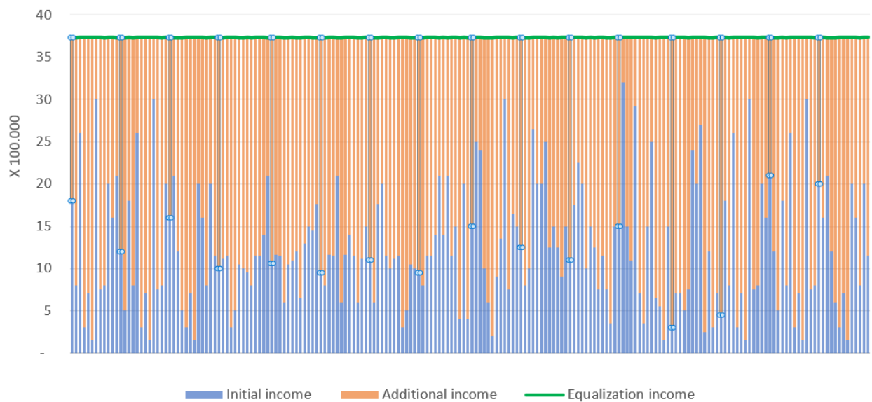
Figure 3. Results of income equality analysis.