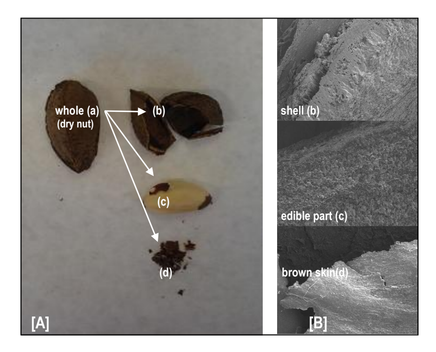
Figure 2: Brazil nut ( Bertholettia excelsa H.B.K.) samples utilized for the Se distribution study: [a] whole, [b) shell, [c] edible nut and [c] brown skin [A] microscope sterioscopic, x1; [B] scan electronic microscope (x50 10Kv, 500 µm).

Brazil Nut Samples Preparation. (a) heating: Nuts from each region were submitted to autoclavation/ (to facilitate the brown skin/shell detaching off the edible part - as carried out in the factories) and left cooling to proceed for next step: (b) shelling. That was carried out utilizing a commercial nut cracker and (c) nut parts separation. Each part was separated into different containing as brown skin, shell and edible part (Figure 2), followed by weighing, grinding in a blender and portions separate for Se, proximate composition, mc and a_w analysis (n=5).