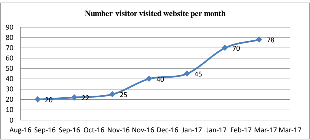
Figure-3. Number of visitors from Aug -16 to Apr-17

Table 2 presents the index o google in 43 position, density key words 441 and page rank number 5/10. As we know just seldom website in Vietnam has the page rank on google is number 5. Those indexes of experiment website on google indicate that our website is successful website. However, to know the number of visitors looking for information via website increase or not we keep monitoring as the Figure 3.