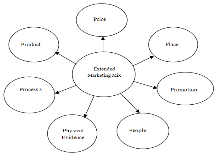
Figure-2. Extended marketing mix model.

Due to the fact that the traditional 4Ps approach to marketing did not adequately address the marketing of a service, a need developed for the marketing mix to include how a service should be marketed. The change came about because services are different from goods in that they are intangible, perishable, inseparable and heterogeneous and as a result, different strategies need to be considered. As such, three new Ps often referred to as the service elements, were invented by Booms and Bitner in 1980 and they include people, physical evidence and process. A combination of the traditional 4Ps and these three service elements is referred to as the extended marketing mix as shown in Figure 2.