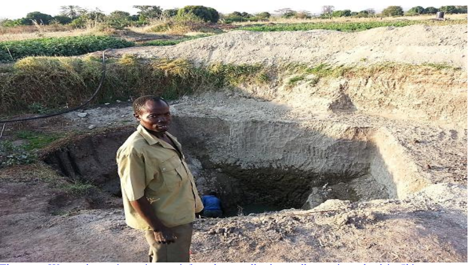
Figure-3. Water abstraction using an informal manually dug well on private land in Shinyanga rural district of Tanzania. The photograph shows the issues associated with environmental degradation and interception of underground water resources.

Water is accessed by buckets or perhaps a separate motorized pump. According to survey respondents, water extraction by private individuals has increased dramatically and historically was not practiced in the area.