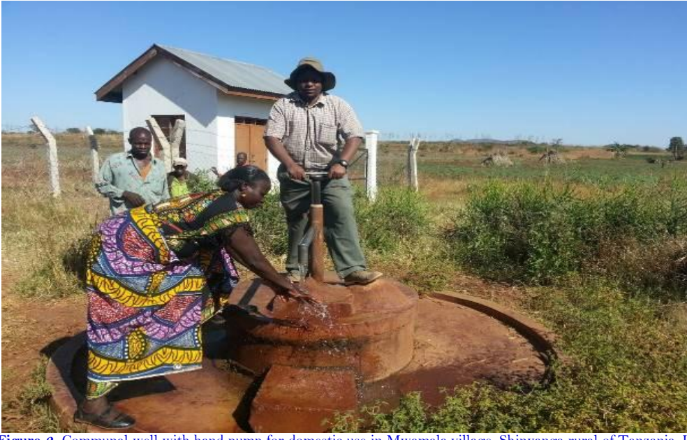
Figure-2. Communal well with hand pump for domestic use in Mwamala village, Shinyanga rural of Tanzania. It is regulated through input contribution to the village water committee, achieved through trained local resource by non-government organizations (NGOs).

Conversely, 132 respondents indicated they had access to three types of water resources (ponds, well and waterholes) which had a very limited capacity to supply water during the dry season and these all had a water management system to govern access (Table 3).