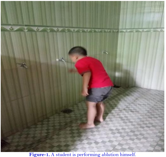
Figure-1. A student is performing ablution

The Figure 1 shows a child who will perform the dhuha prayer but not perform ablution from home. The child as seen in the picture above is an independently child.