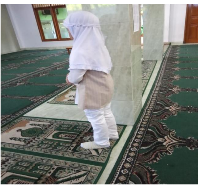
Figure-3. An independent student is praying Duha.

The Figure 3 shows A child who is able to perform the dhuha prayer alone complete with the pray of prayer of dhuha . The child belongs to group B.