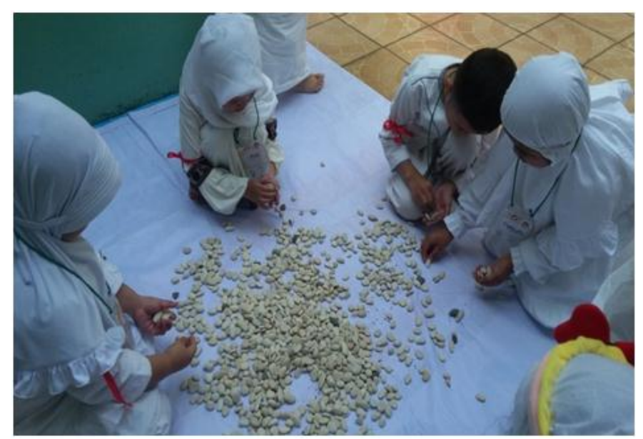
Figure-6. Students pick up stones to throw jumrah.