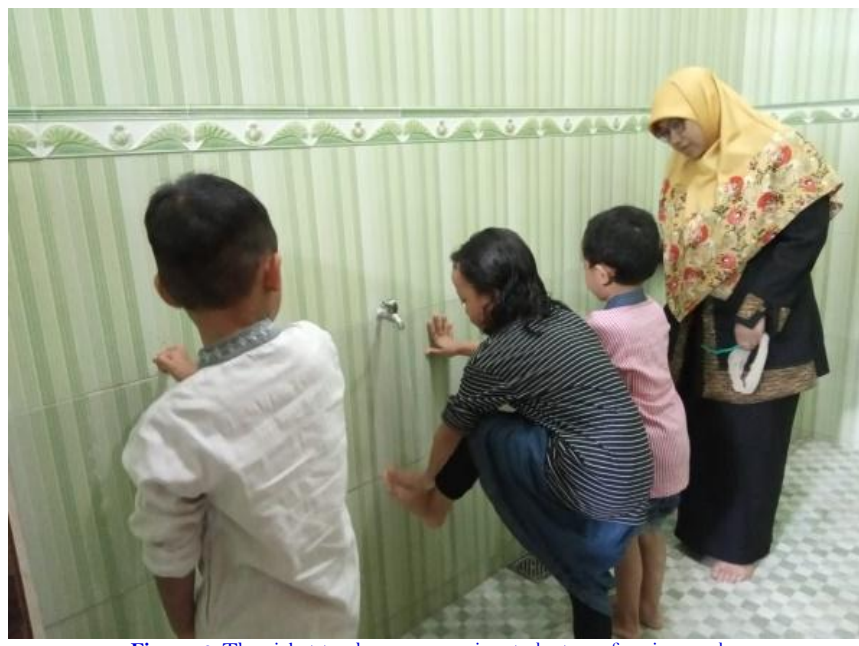
Figure-2. The picket teacher accompanies students performing wudu.

The Figure 1 shows a child who will perform the dhuha prayer but not perform ablution from home. The child as seen in the picture above is an independently child.