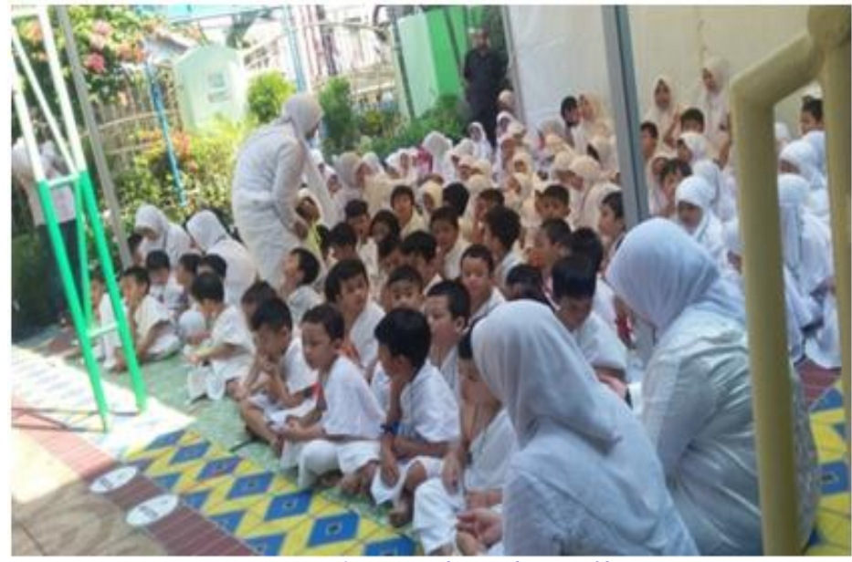
Figure-5. Students gather at arafah.