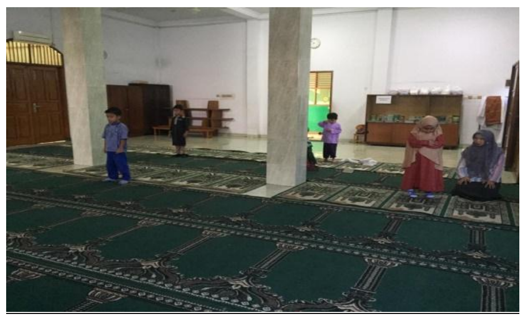
Figure-4. The teacher accomples students belong to group A to perform prayer dhuha.

The Figure 3 shows A child who is able to perform the dhuha prayer alone complete with the pray of prayer of dhuha . The child belongs to group B.