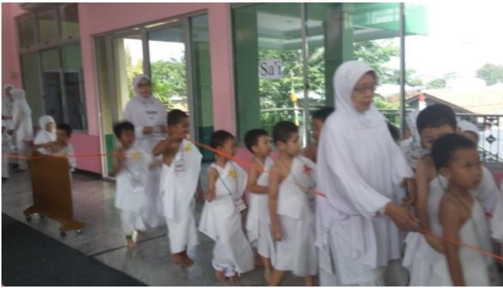
Figure-7. Students do Sai.