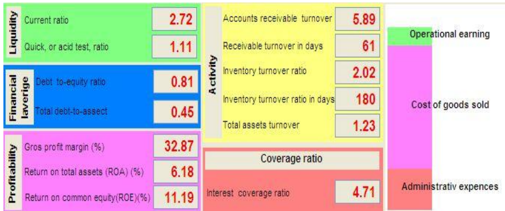
Picture-2. Profitability indicators of the company

When the amount of the fixed and variable costs are changed it comes to modification in the graphic on the company's profitability. The three different colors represented administrative expenses as a percentage: (red), cost of goods sold (pink) and operational earning (green) which provides a visual representation of the incomes for a given production.