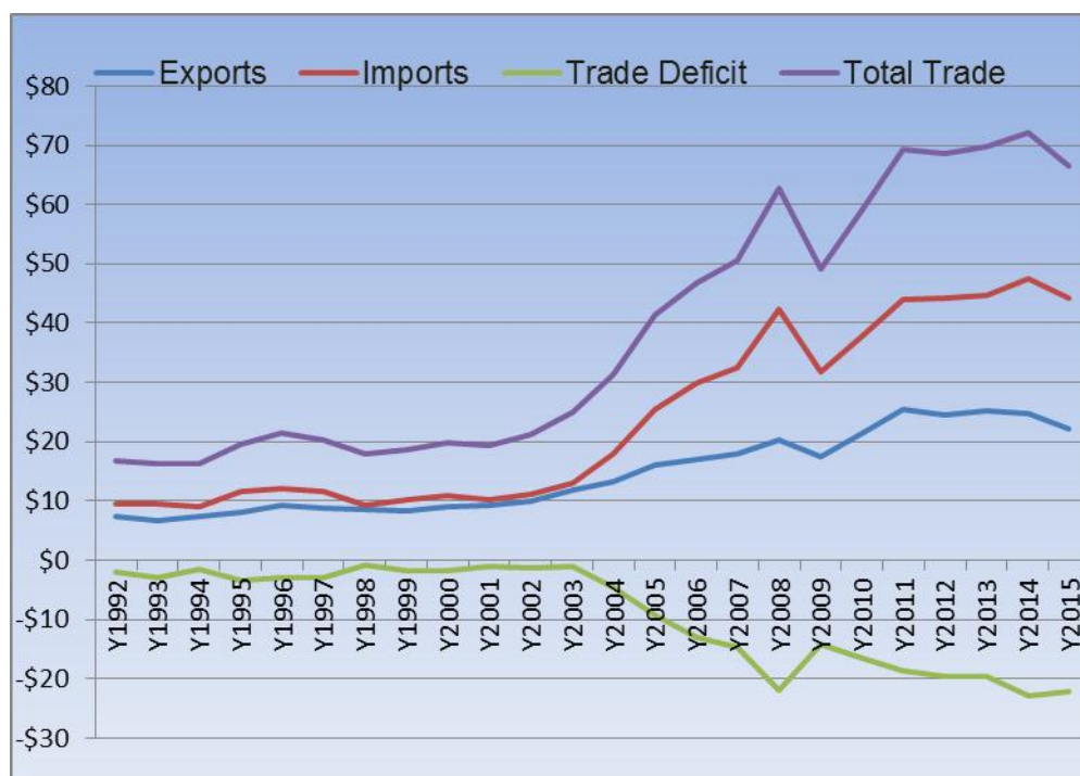
Figure-A. Foreign Trade Flow of Pakistan (US$ billions)

Source: Author's own calculations based on ITC &amp; UN COMTRADE statistics