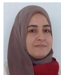
(+ Corresponding author)

2 Département Gestion Institut Supérieur d'Administration des Affaires de Sfax, Tunisia