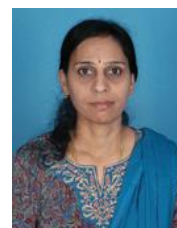
(+ Corresponding author)