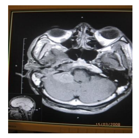
FIG 8-Axial T1W enhanced MRI showing an enhancing right CPA mass effacing ipsilateral cerebellar fissures.