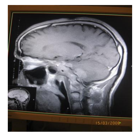
FIG 7- Sagital contrast T1W MRI showing an enhanced mass compressing the cerebellum

FlIG 6-Enhanced Coronal T1W MRI showing assymmetry of petrous bone due to right CPA mass