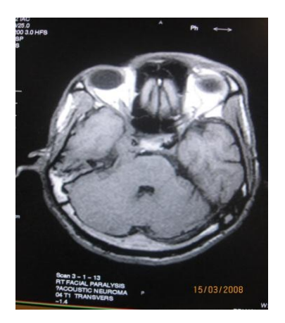
FIG 4- Axial T1W MRI showing the extracanalicular right CPA mass growing in a cranial direction

FIG 3- Gd-DTPA Enhanced axial T1W brain MRI showing homogenously enhanced right CPA mass.