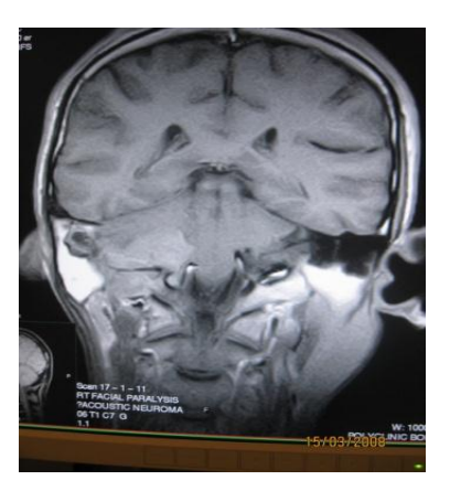
TIG 5- Enhanced Coronal T1W MRI showing right CPA mass lying in relation to middle cerebellar peduncule.