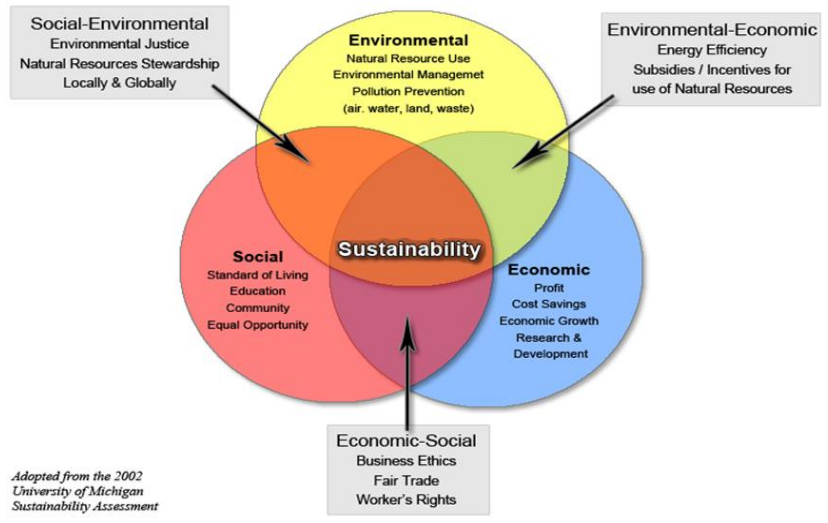
Figure-1. The Three Spheres of Sustainability

Source: Adapted from Sustainability Assessment and Reporting for the University of Michigan's Ann Arbor Campus (2002)