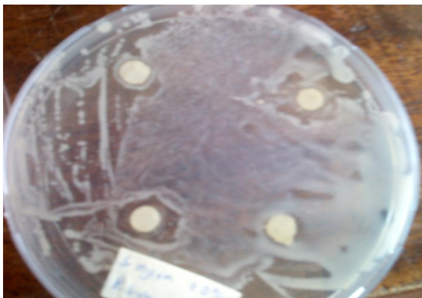
Plate 4. 7.5% P. syringae inhibition zones