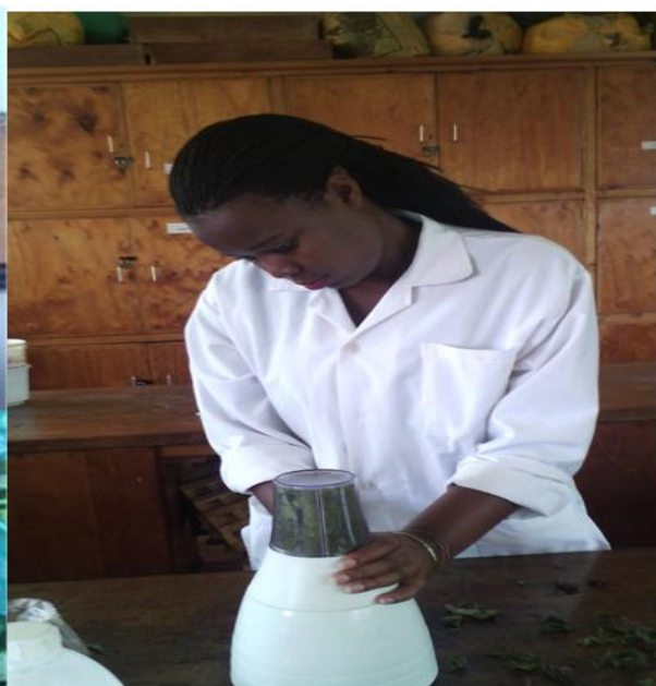
Plate-2.2. Extraction of S. nigrum leaf extract