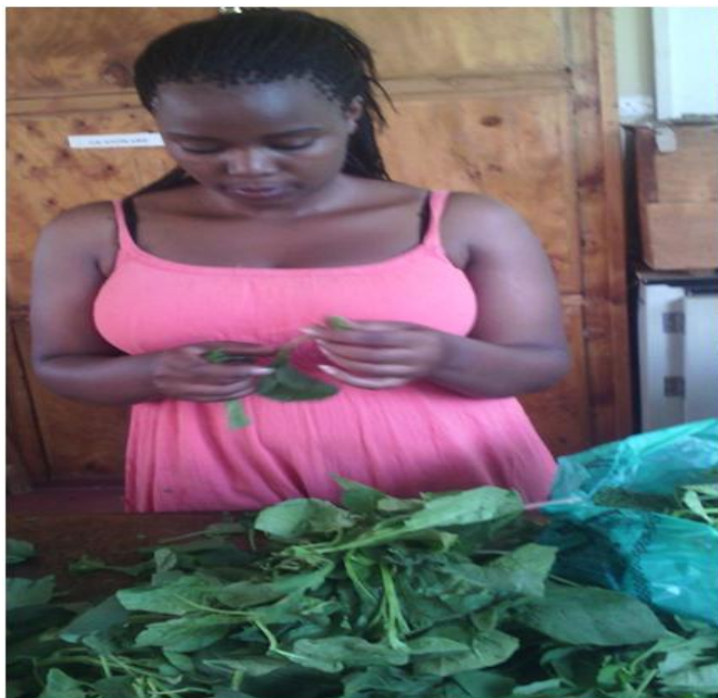
Plate-2.1. S. nigrum leaves before shade drying

Leaves of plants identified to be S. nigrum were collected from the Maseno University farm, examined and soil shaken off in the botany Laboratory. Maximum care was taken to avoid destruction (Plate-2.1).