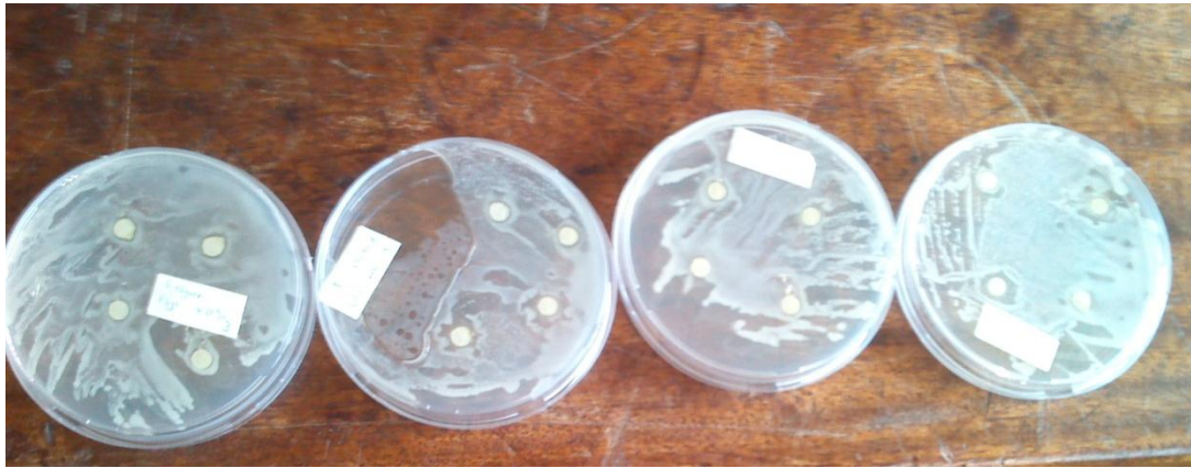
Plate-3.1. A representation of 2.5%, 5%, 7.5% and 10% of P. syringae impregnated Petri dishes.

The antimicrobial activities of Solanum nigrum leaf extract was examined against the microorganisms and their potency accessed by the presence or absence of an inhibition zone the results are shown in plates 3.1 and 3.2