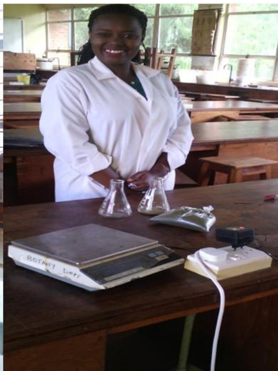
Plate-2.4. Electronic weighing machine