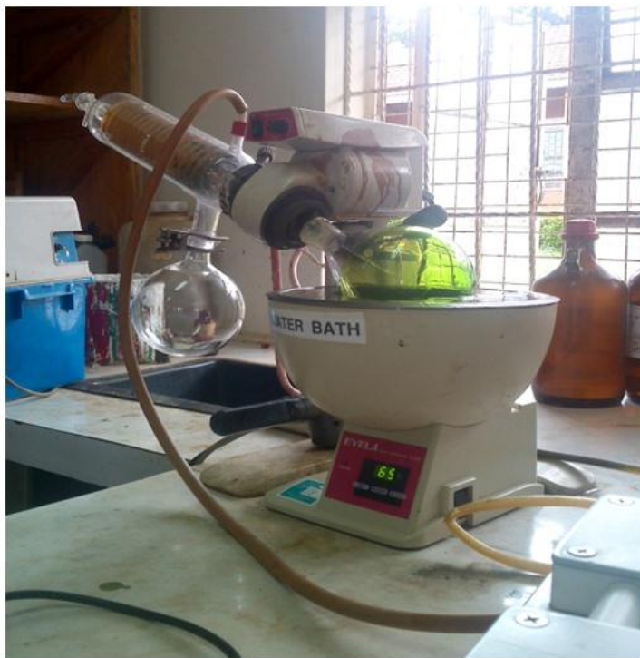
Plate-2.3. Rotary evaporator pump

The leaves of S. nigrum used for extraction were shade dried, after which the dried leaves were powdered and stored in a sterile bottle at room temperature [8]. Powdered dried leaves were weighed using an electronic weighing machine (plate 2.4), and ethanol used in the extraction. 100g of powdered dry leaves was extracted with 200 ml of ethanol and then concentrated using a rotary vapor pump (plate 2.3).