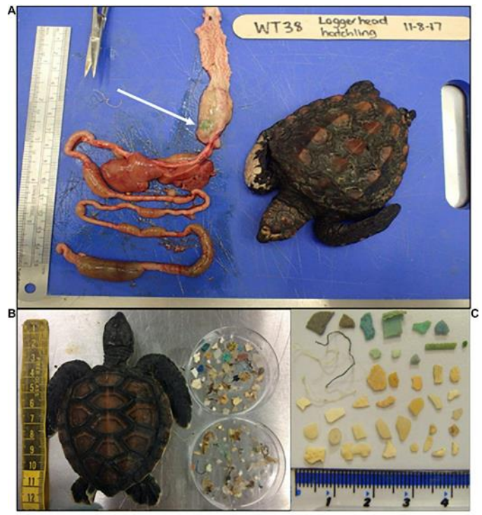
Figure 2(a). The digestive system of the turtle contains pieces of plastic. (b) Plastic erupting from a green turtle's cloaca on Cocos Island, Costa Rica (c) the pieces of plastic and the size of it.

Ingestion sometimes occurs directly when plastic pieces are mixed with the food of choice for these sea turtles, for example, a study found that small green turtles (Chelonia mydas) inside their digestive system contain pieces of plastic because they feed on a type of macro algae that had plastic pieces attached to it Di Beneditto and Awabdi [24]. Indirect ingestion where the plastic particles are within the prey tissues that feed on sea turtles like some molluscs and crustaceans [25]. In addition to plastic ingested by sea turtles, there are other possible effects of plastic pollution, sea turtles intertwine with plastic waste from fishing nets and other fishing gear that causing difficulty moving to avoid predators or loss of turtle tips. Several cases were recorded in this regard [26].