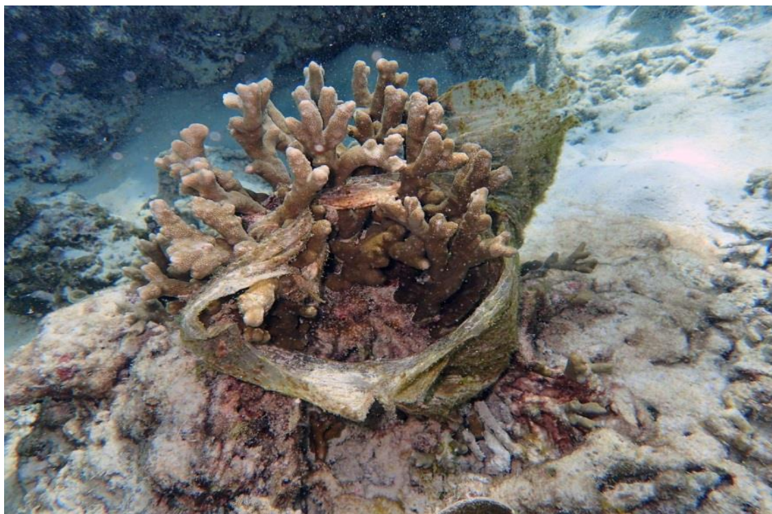
Figure 1. Spawning coral wrapped in plastic [13].