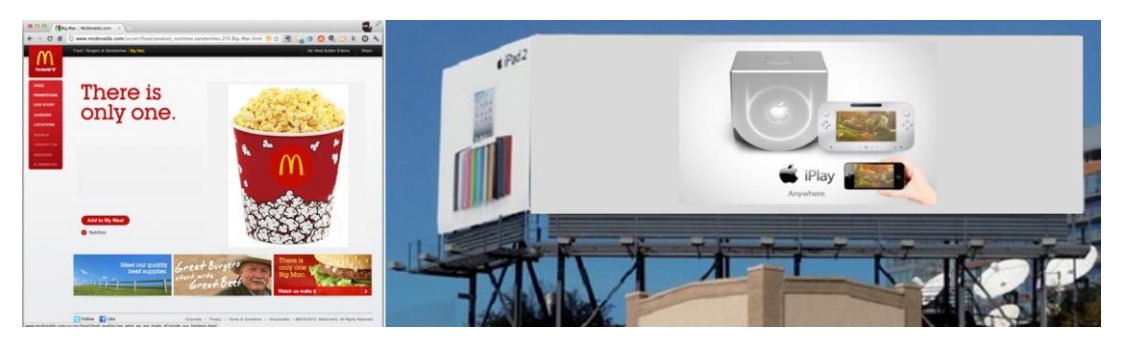
Figure 1: Photographs presented in the first section of the survey (the left is McDonald's popcorn on the official webpage and the right is iPlay on the outdoor billboard)

There were two reasons why fake products were used in the survey. First, the fake products were obviously not seen by the respondents before. Thus, the products themselves did not influence the responses that should reflect only respondents' interest in media. Second, after presenting fake product advertising to respondents, it was possible to test if respondents would really believe that they were real products in the perceived truthiness test (i.e., the second component of the research instrument used in this study).