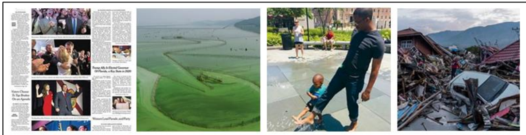
Figure 5: Photo exemplars of New York Times

various lifestyles due to its ability to tell stories in social media. The photos may change and expand how people see humanity and society. In addition, they may simply touch people and open a way to their memories, feelings and imagination. Furthermore, documentary photos are normally found in the newspaper and they follow a story or a topic thoroughly over time (see the rightmost photo in Figure 5). They deepen audience's understanding and emotional connection to the stories. They capture the visual representation of a story. Everything that is interesting may become documentary photos that are authentic and not artificially forged to suit the untrue narrative.