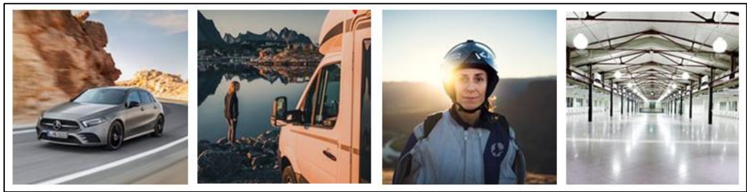
Figure 3: Photo exemplars of Mercedes-Benz