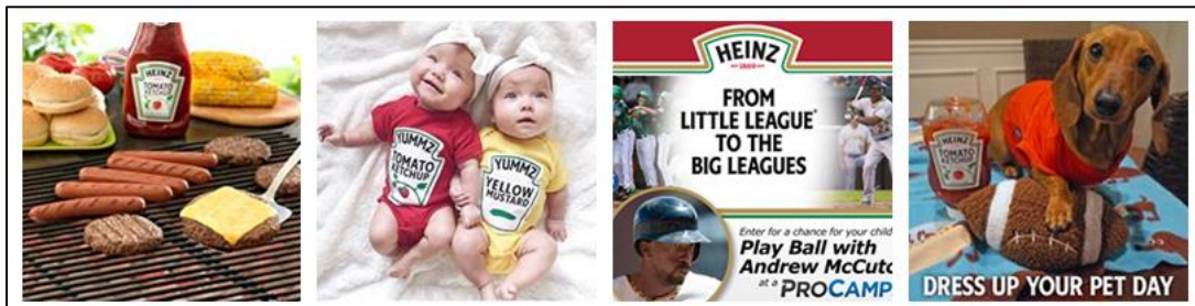
Figure 2: Photo exemplars of Heinz ketchup