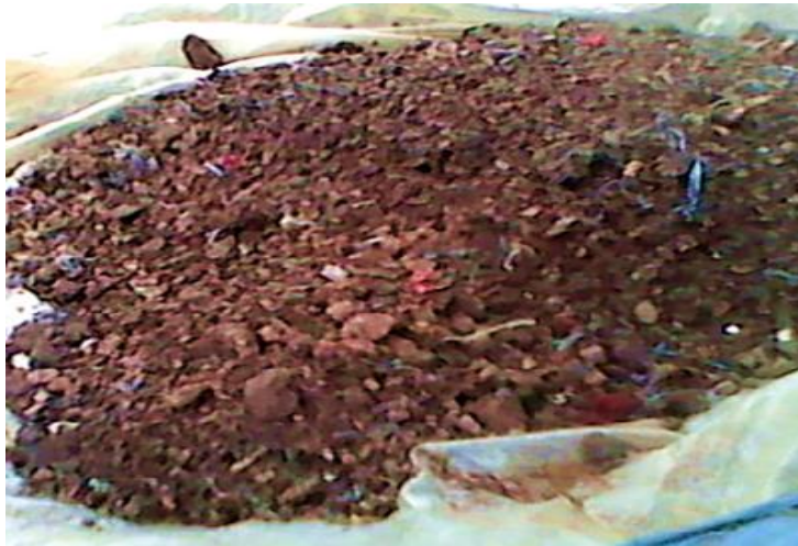
Figure 3: Cocoa bean teguments