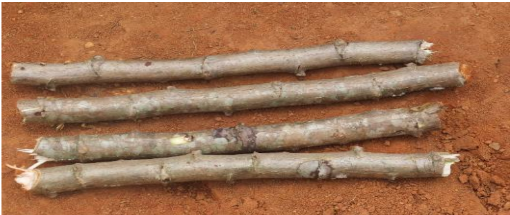
Figure 2: Cassava cuttings (Improved African Cassava)

The experimental trial focuses on cassava, a tuberous root plant. The cassava variety ( Manihot esculenta Crantz ) used for this study is Improved African Cassava (commonly called yacé ) (Figure 2). It is a resistant variety, commonly grown and consumed by the Ivorian population in different forms (cassava paste, flour, starch, bread, cake, etc.).