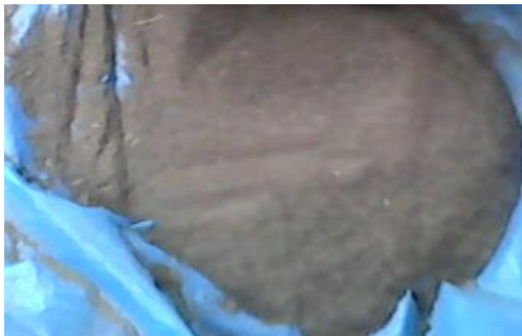
Figure 5: Powder of cocoa bean teguments

The cocoa bean teguments, obtained in a dump in Abobo (Abidjan), were dried, crushed and sieved ( \phi < 2 mm) before being spread (Figure 5).