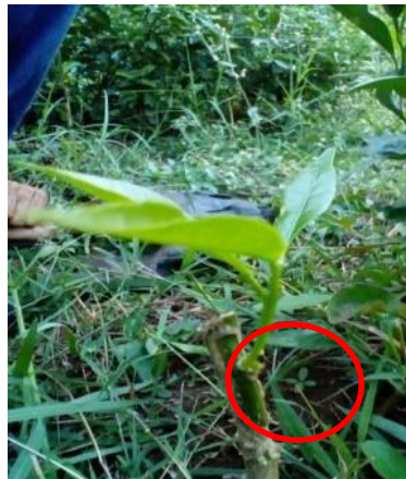
Figure 6: Number of leaves at 45 DAB

Notes: Average figures of the same coloumn followed by the same letters are not significantly different based on Duncan test at 5%