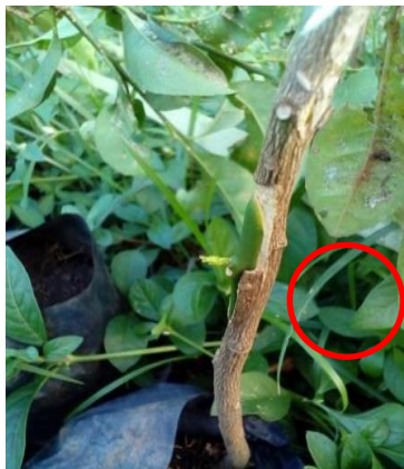
Figure 3: Start growing

The result of observation the starting time of bud appearance as shown in the appendix 7 and the figure is as below: