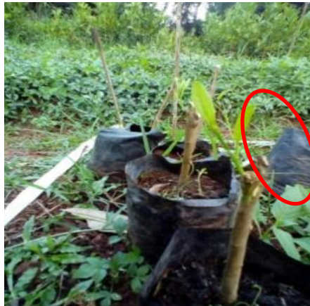
Figure 4: Length of sprout at 45 DAB

Notes: Average figures of the same column followed by the same letter are not significantly different based on Duncan test at 5%