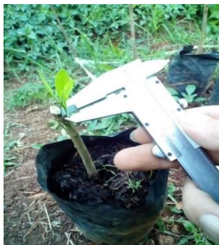
Figure 5: Diameter of stalk

Notes: Average figures of the same column followed by the same letter are not significantly different based on Duncan test at 5%