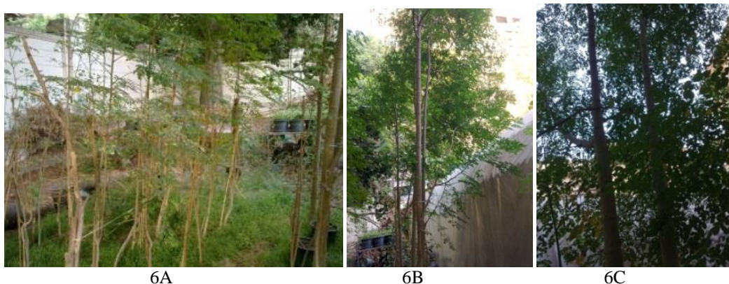
Figure 6A, 6B & 6C: Moringa oleifera planted in Seed Bed, and Trees of 3 years old (9 m high) in Research Garden of Faculty of Agriculture, Cairo University