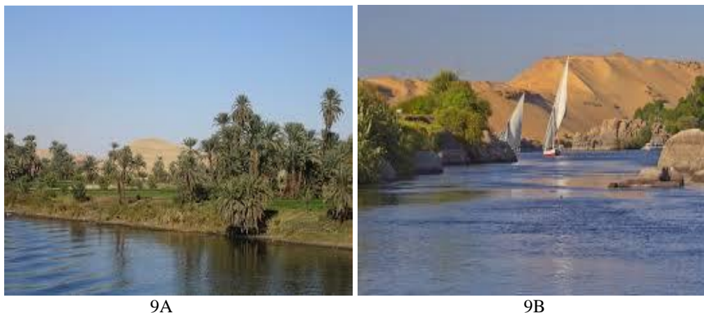
Figures 9A and 9B: The Nile water available is waiting for man-involvement to re-green its banks

The Figures 9A and 9 B below show water and possible plant to be grown. There is a big hope, a dense forest will establish in this area with the available water of the Nile. For comparison, water is always available in the bank of the Nile for the year long, but rainfall is only available in rainy season in Gunungkidul of Indonesia. So, we are optimistic woods and forest will develop in this area of the Nile banks. And we believe that in this area, a long time ago, were ever-green woods and dense forest. It is stand to reason academician of Egyptian said “Egyptian land was greener than Indonesian land”.