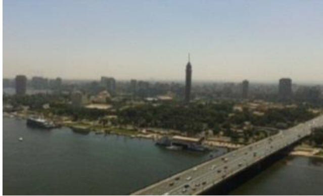
Figure 1: Rich and big city of cairo passed by the Nile river

Egypt is famous as a country of having long and high civilized culture since the era of ancient Egypt, and it evident are apparent from artifacts found and mentioned in the Holy Qur'an. And indeed big and populous city of Cairo indicating that Egypt has been inexistence among the oldest and civilized countries in the world. Egyptian land is predominant barren desert, but the Nile River makes the country prosperous and really beautiful as Figure 1.