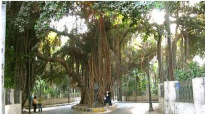
Figure 2: Woody plants species grow well in Cairo

Woody plants growing well (as shown in Figure 2), is showing that land in this country is arable. Geographic and climatic data show Egyptian land is mostly desert and with its very low rainfall. This natural condition may sometimes be associated with poor and backward country, but not for Egypt. So, why is Egypt prosperous and belonged to developing or developed country? Seeing the demographic and natural sources, the answer is because Egypt is passed and controls the Nile water with its continuous considerable debit supplying irrigation water for agricultural practices.