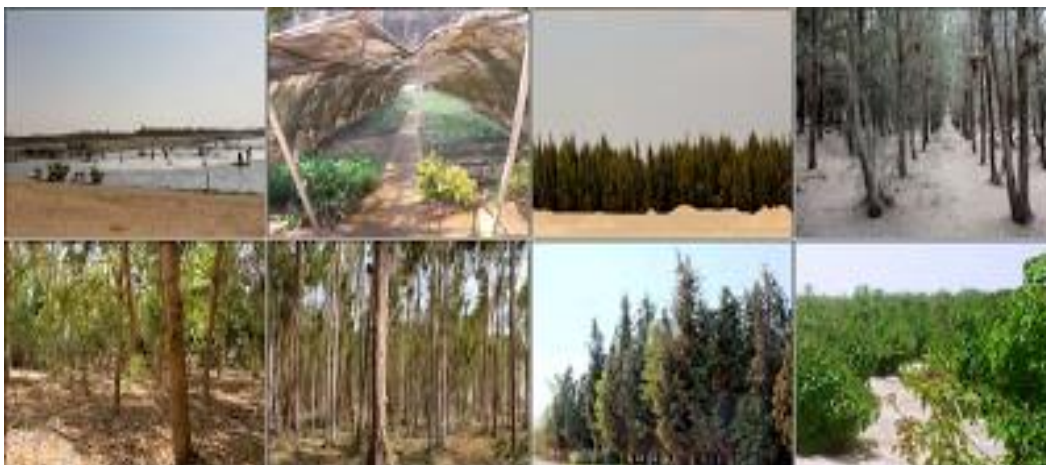
Figure 4: Upper photos from right: sewage water basin; tree nursery; afforestation in desert land; and casuarina plantation. Lower: khay a trees; eucalyptus; Cupressus; Jatropa plantation

El-Ghani et al. (2011) described around Egyptian desert is still found some climbers. In some genera, all of the species are climbers (e.g. Serjania). High abundance of climbers is an important physiognomic feature differentiating tropical from temperate forests. Figure 4 shows some woody plants of afforestation in Egypt.