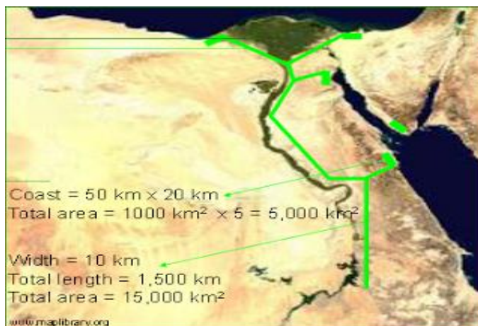
Figure 5: Map of afforestation in Egypt Hany et al. (2014)