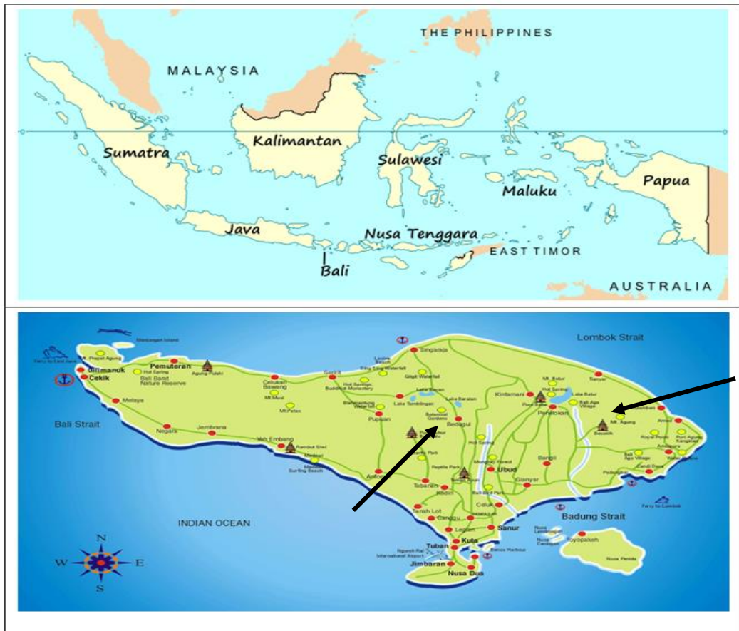
Figure 2: Site map

Primary and secondary data were collected in the study by using various techniques, such as survey, interview, direct observation and documentation. In order to have deep information, the technique of Focus Group Discussion (FGD) was also employed by inviting the key informants of farmers groups, market actors (local traders, exporters, officers of local governments, officers of local banks, and staff of research institution). In this study, data were analyzed by using descriptive method.