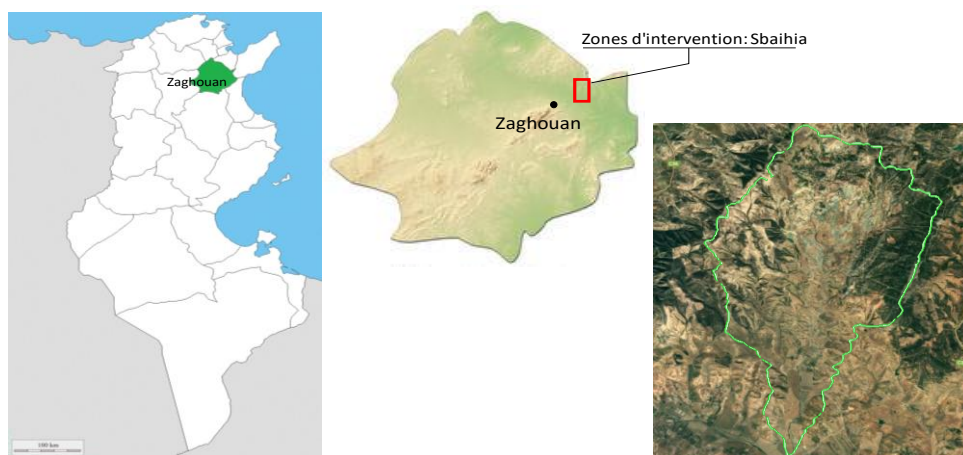
Figure 1: The geographical location of the Oued Sbaihia watershed at the governorate of Zaghouen, Tunisia

Zaghouan governorate is located on the eastern slope of Mount Zaghouan and dominates a vast agricultural plain (Figure 1). The Oued Sbaihia watershed is administratively attached to the Zaghouan delegation. This area is on the ridge of the Tell Atlas. The area is located in the semi-arid bioclimatic floor. The latitude to the right of the site is 36G41 'while the longitude is 10G19'. The examination of the temperature data showed the variation of the temperatures recorded during the year 2018, which vary between 37.8°C in July, and 6°C in February (FAO, 2011).