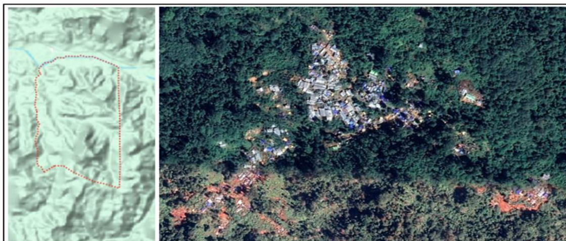
Figure 1. Research site: West Tulabolo village (Left) and ASGM site (Right) located around 10 km southeast from the village.

The present study was carried out in West Tulabolo Village, which is situated in the East Suwawa District of the Bone Bolango Regency in the Gorontalo Province, as shown in Figure 1. Covering an area of 16.06 km 2 , West Tulabolo Village constitutes approximately 12.57% of the total land in the East Suwawa District. The village comprises three dusun : BulaboDaa, Bulabo Diti, and Dudamu, with a total population of 513 individuals. While the majority of the villagers work in the mining sector as motorcycle taxi drivers or mining workers, the agricultural sector of West Tulabolo Village has significant potential. The main agricultural products that the local farmers cultivate are corn, chili, and coconut.