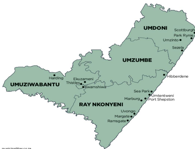
Figure 1. Map of RNLM.

The study was carried out in the RNLM under the Ugu District Municipality of KZN province. The RNLM is also known as the South Coast due to its positioning in the southern coastal part of KZN (Figure 1).