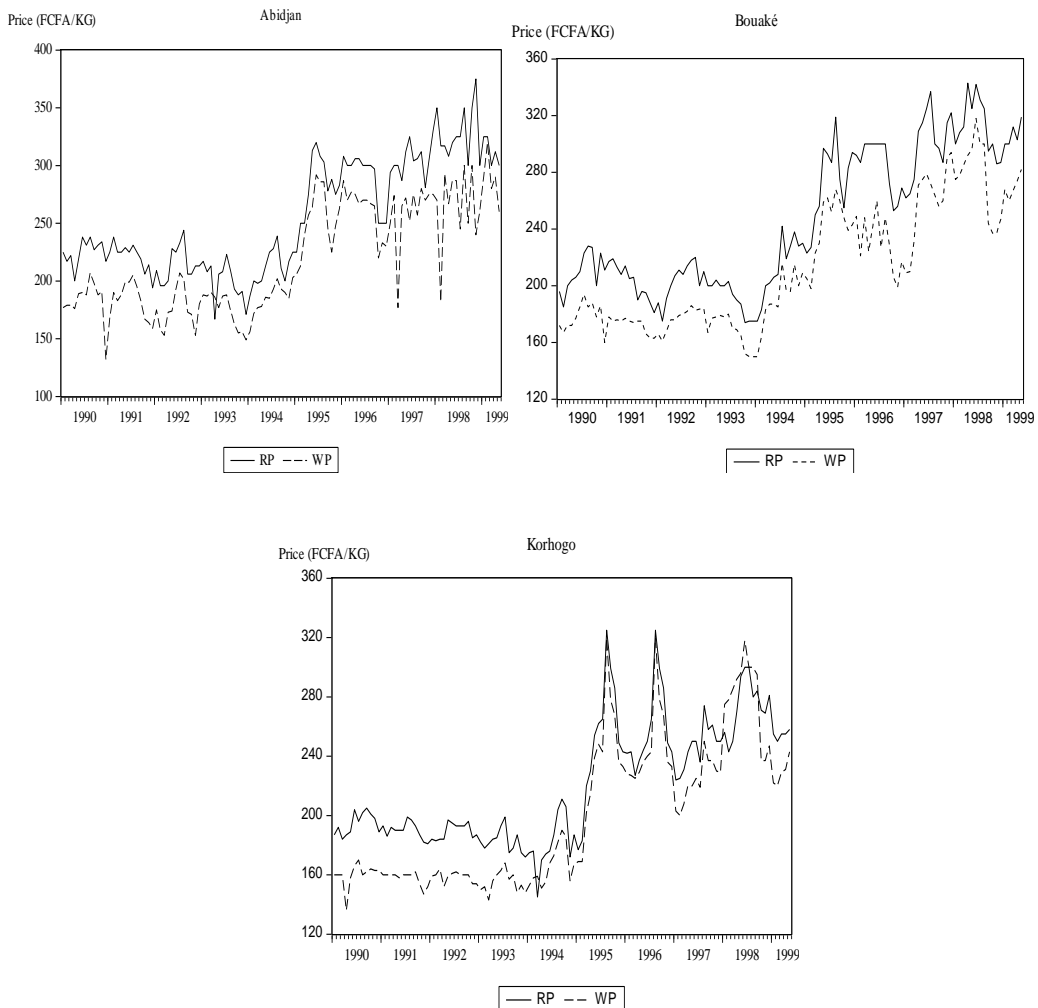
Figure 1: Evolution of wholesale and retail prices over the period 1990-1999

Figure 1 shows the evolution of monthly wholesale and retail prices over the period 1990–1999 for each of the three markets under study. An overall look at this figure shows that wholesale and retail prices move in parallel. This gives an indication that the two series are cointegrated in the long run. However, this visual inspection does not give the nature of this relationship.