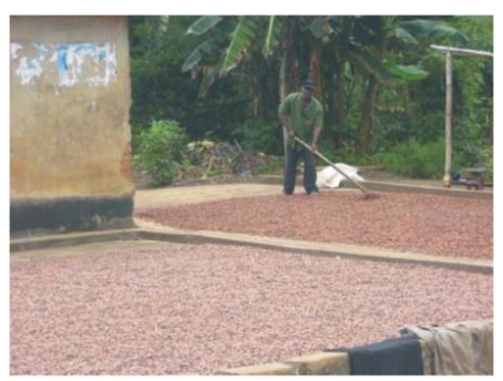
Figure 6: Drying of cocoa beans on concrete slabs in Iloro-Idanre