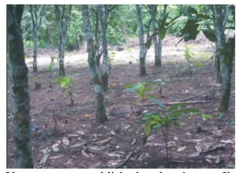
Figure 4: Young cocoa established under citrus at Iloro-Idanre