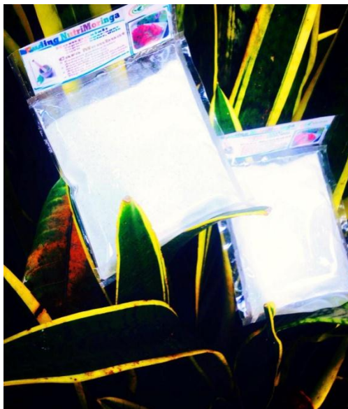
Picture-3. Nutri Moringa Pudding Sachet