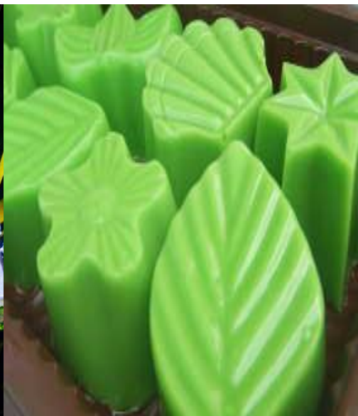
Picture-4. Nutri Moringa Pudding