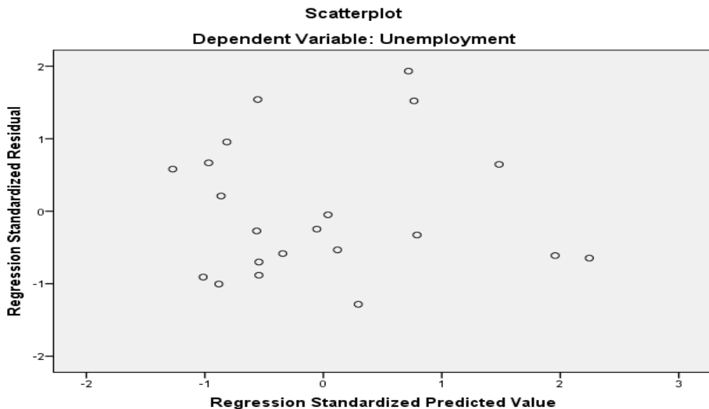
Figure-1. Scatter plot of standardized residual with standardized predicted value

Standardized residual is the ratio of residual and variance of raw residual. Standardized residual are the unit free values. Almost 68% standardized residuals fall in \pm 1 range, 95% in \pm 2 range and almost all Standardized residual fall in \pm 3 range. Any standardized residual that is greater than 3 is potentially outlier. Results in Table 3 depicted that residual are approximately normally distributed with zero mean and constant variance (0.42). Also, the maximum and the minimum of the standard residuals lie between \pm 3 which indicate that there is no outlier in the residuals.