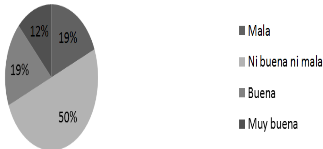
Gráfico-1. General Health Rating sample in%.

Through the socio-demographic questionnaire results show that the whole sample are women and the municipality of Oimbra. It is also noted that 13 of them are married (81.25%), 1 single (6.25%), 1 separate (6.25%) and 1 widow (6.25%). In relation to their education level one cannot read or write (6.25%), 2 have not completed the minimum studies (12.5%) and 13 Primary studies have graduate or EGB (81.25%). It also identifies that 10 respondents to a dependent care (62.5%) and the remaining 6 to several relatives (37.5%). Regarding the dependent family shows that in 3 of them is your spouse (18.75%) in 10 participants (62.5%) their parent (middle his father and the other his mother) and in 2 his father (12.5%) and her mother-in-1 (6.25%). Depending on the degree of dependence that have the results show that in June with a degree II (37.15%) and 10 grade III (62.5%). Finally on the number of years of care provided so far shows that 6 indicate less than 10 years (37.5%), 1 July period between 10 and 15 years (43.75%) and 3 between 16 and 20 years (18.75%).