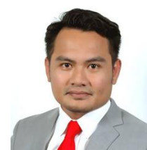
(+ Corresponding author)