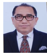
(+ Corresponding author)