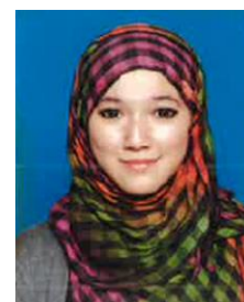
(+ Corresponding author)

1,2,3,4,5 School of Social Sciences, Universiti Sains Malaysia, Malaysia