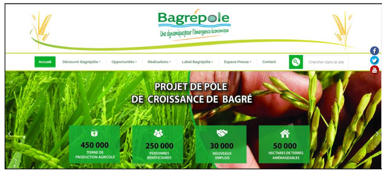
Figure-1. Home Page of the Bagré Growth Pole Project website (Screenshot of 27 March 2017)