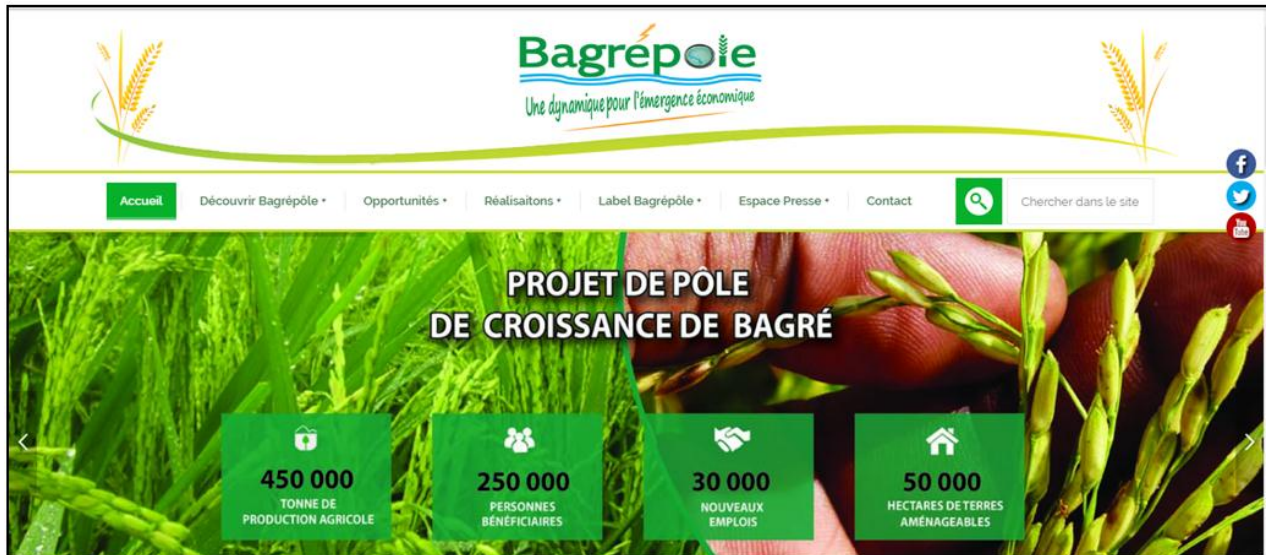
Figure-1. Home Page of the Bagré Growth Pole Project website (Screenshot of 27 March 2017)