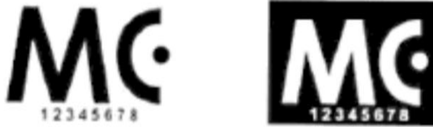
Figure-1. Two conformity mark formats with illustrative approval number.