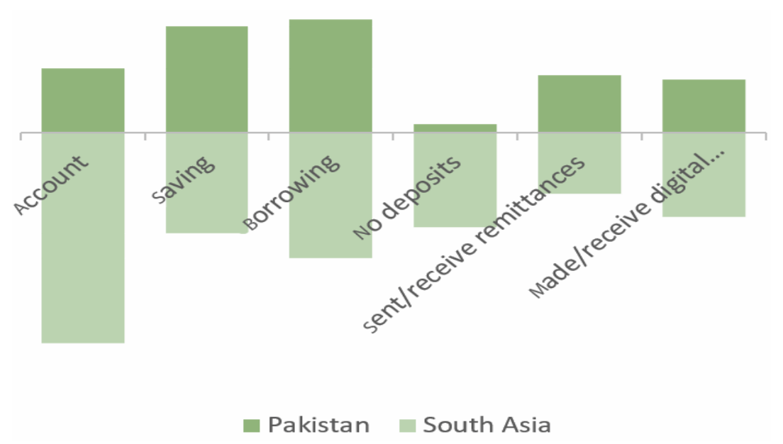
Figure 3. Financial inclusion situation in Pakistan and South Asia (2017).

Table 1. The situation of financial inclusion across various demographic groups.