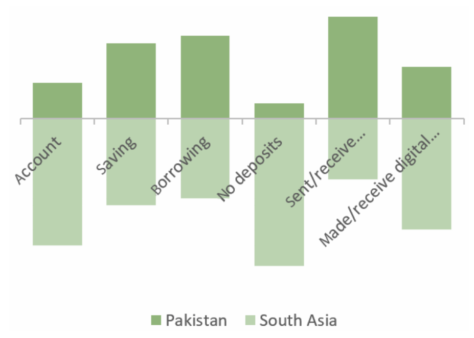
Figure 2. Financial inclusion situation in Pakistan and South Asia (2014).

The situation of financial inclusion in Pakistan is not very promising. According to GFI (2018), it is one of the least financially inclusive countries in the world. Figures represent the comparative analysis of financial inclusion in Pakistan with other South Asian countries in 2014 and 2017. Figure 2 represents the situation of different financial inclusion indicators in Pakistan and South Asia in 2014. Account ownership difference in Pakistan and South Asia is huge. 47 percent of the adults have accounts in South Asia while it is only 13 percent in Pakistan.