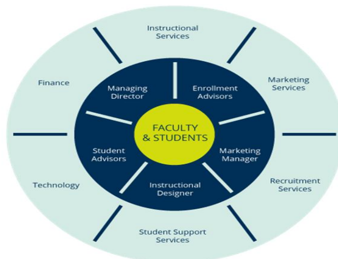
Figure-1. Faculty and students with personalized education resources.

Today, the entire world is being digitized. In the field of education, almost all educational resources and learning materials are digitized. Personalized services are designed according to educational resources initiative learners interested preferences, learning environment, information needs through learner main dynamic customization, system recommendation, etc., proactively provide learners with information and services that may be of interest to them. At the same time, according to learners' feedback dynamic update learners' needs and services, is an important solution to solve the information and knowledge gap Trek proposed. Starting from the connotation of educational fairness, this paper analyzes the challenges faced by the educational process fairness in the level of individualized educational resources acquisition and explores education. Figure 1 shows us the faculty and students with personalized education resources.