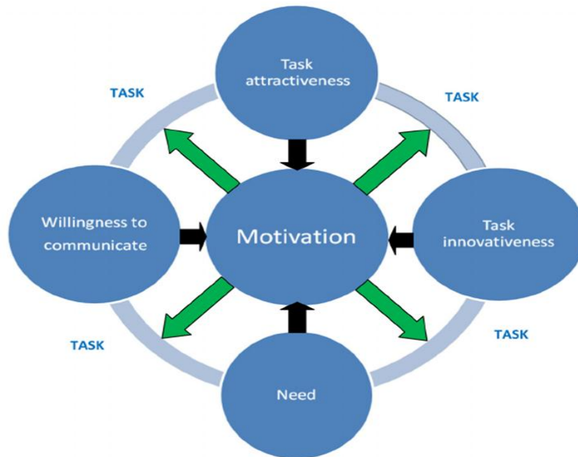
Figure-2. Motivation and task cycle in the process.