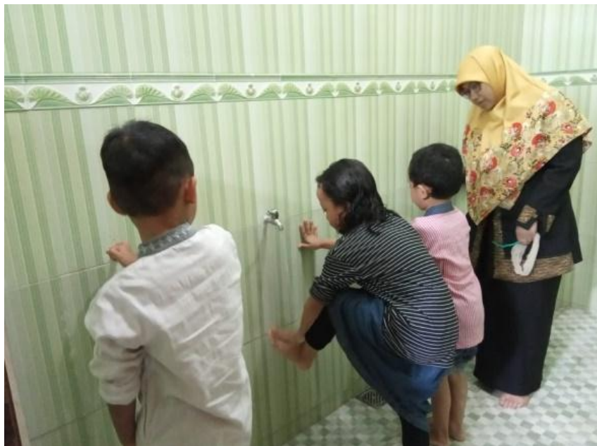
Figure-2. The picket teacher accompanies students performing wudu.

The Figure 1 shows a child who will perform the dhuha prayer but not perform ablution from home. The child as seen in the picture above is an independently child.