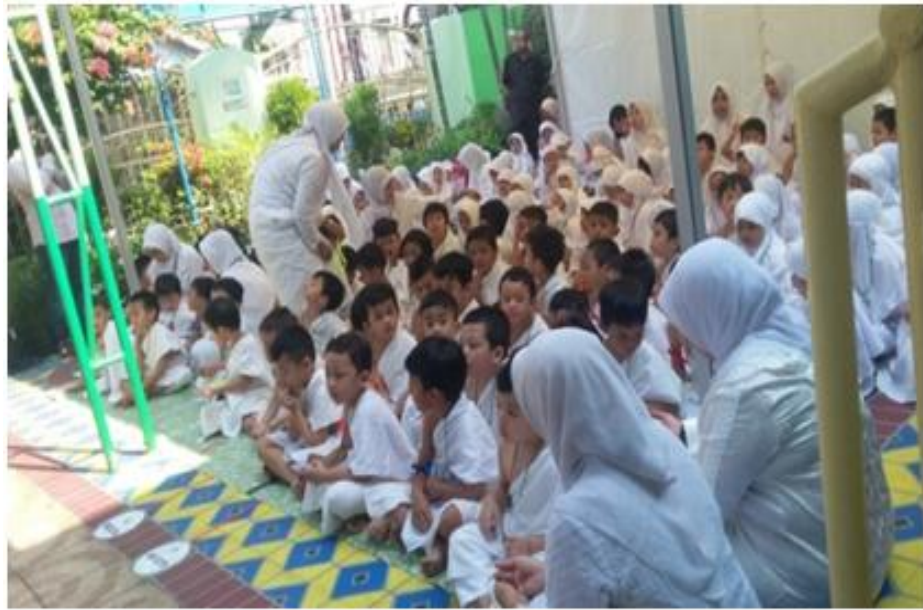
Figure-5. Students gather at arafah.