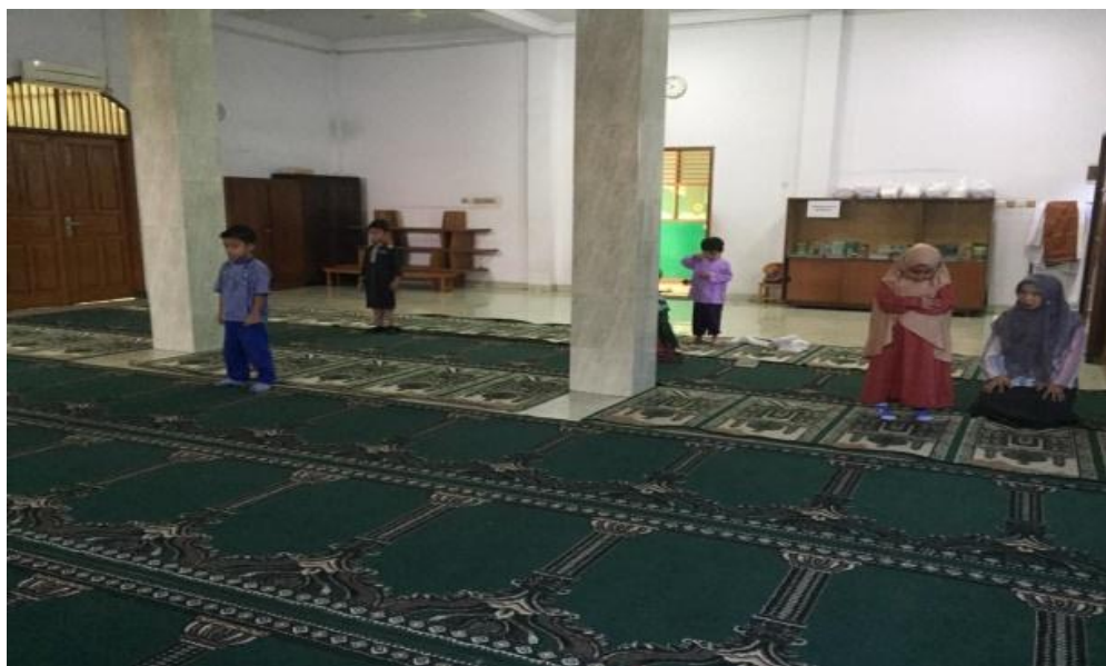
Figure-4. The teacher accompies students belong to group A to perform prayer dhuha .

The Figure 3 shows A child who is able to perform the dhuha prayer alone complete with the pray of prayer of dhuha . The child belongs to group B.