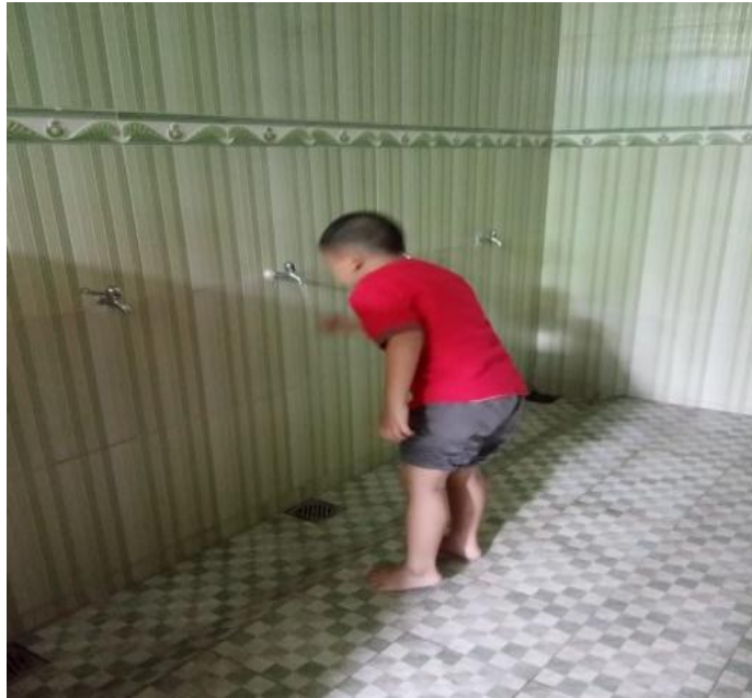
Figure-1. A student is performing ablution himself.

The Figure 1 shows a child who will perform the dhuha prayer but not perform ablution from home. The child as seen in the picture above is an independently child.