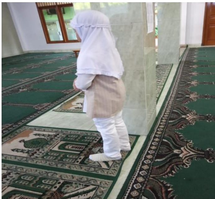
Figure-3. An independent student is praying Duha.

The Figure 3 shows A child who is able to perform the dhuha prayer alone complete with the pray of prayer of dhuha . The child belongs to group B.