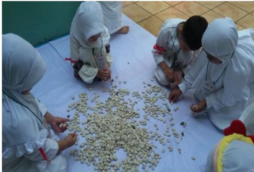
Figure-6. Students pick up stones to throw jumrah.