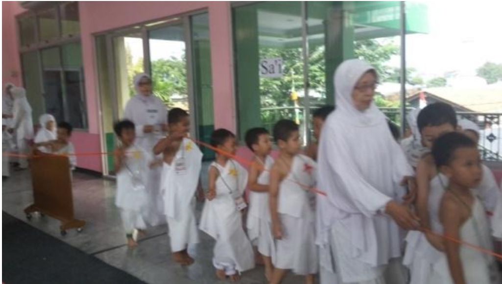
Figure-7. Students do Sai.