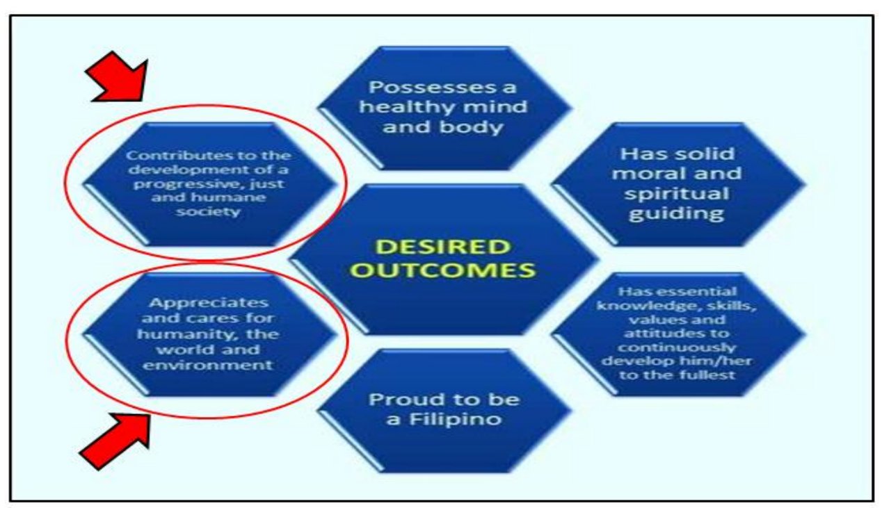
Figure-2. DepEd enumerates the ideal attributes of a graduate from the K to 12 program.

In agreement with Cortez (2016), Corpuz defines critical thinking not merely as a cognitive activity but "an act of applying unless it eventually dies." Critical thinking, therefore, necessarily involves the social and political dimensions of human learning, the very same thought meant by Freire when he considers education as conscientization . Two of the desired outcomes of the Program could be attributed to this thought as shown in the illustration (Department of Education, 2012):