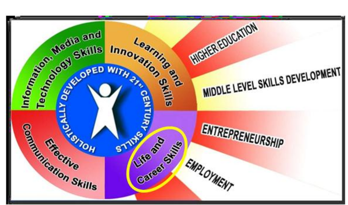
Figure-3. A graduate of the K to 12 curriculum is pictured to be holistically developed with the essential skills for the 21st century

It was reiterated that the distinguishing feature of the Program is its being learner-centered. Critical thinking, which is an essential characteristic of the learner, was argued to be differently understood by many educators than critical pedagogues. Thinking is critical because it appeals to higher thinking and not because it brings a sense of freedom and empowerment to the learner. Therefore, what is meant by critical thinking in CP exceeds what is in the commonly used taxonomy of learning objectives. The closest idea of critical thinking adhering to the tenet of CP is what Corpuz calls system-thinking, or metacognition , which allows one to relate his learning to himself – why he needs it or what good it gives him. As to the issue of empowerment, the question about the K to 12 Curriculum being apolitical was raised. If seen closely, it appears that almost the entire curriculum caters to the economic agenda. The main objective was still on enhancing the graduate attributes for employment. Learning under the Program is, after all, primarily aimed at the economic and then only consequently the politic . Corpuz made an important clarification, however when she claimed that under the K to 12 Program, "politics could still be a part of life and career skills ," as shown in the proceeding figure: