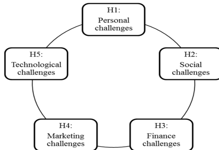
Figure-1. Research Framework by the researcher.

The independent variables for this research have been identified as the challenges of women entrepreneurs facing in online business while dependent variable studied as growth of women's entrepreneurship in in e-commerce around Klang Valley. These challenges were categorized into five elements namely, personal challenges, social challenges, financial challenges, marketing challenges and technological challenges. The research framework illustrated as shown in Figure 1 .